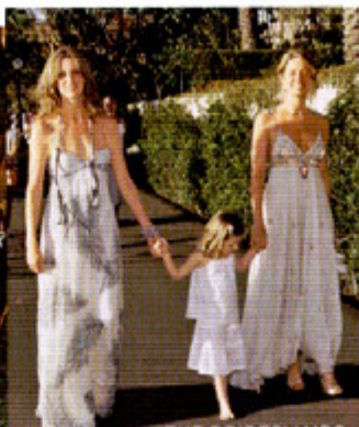
THE BRIDESMAIDS WORE PASTELS.

BOYKIN AND CELERIE CELEBRATED WITH 300-PLUS SPARKLERS.