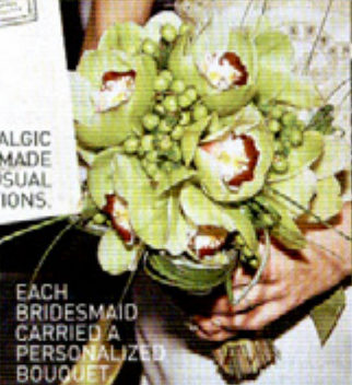
EACH BRIDESMAID CARRIED A PERSONALIZED BOUQUET.